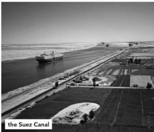
the Suez Canal