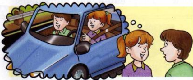
7. drive around town