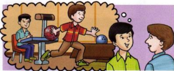
5. go bowling