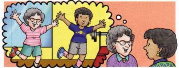
4. work out at the gym