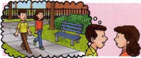
3. take a walk in the park