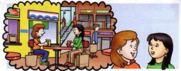
2. go to the mall