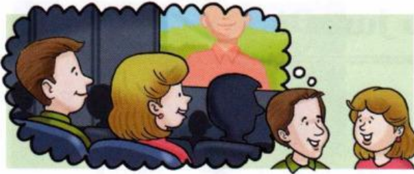
1. see a movie