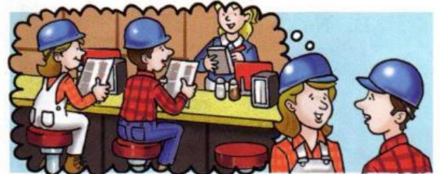
6. have lunch at Dave's Diner