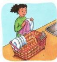
3. dry the dishes