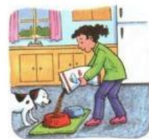
6. feed the dog