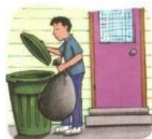
5. take out the trash