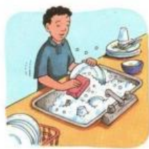
2. wash the dishes