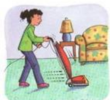
4. vacuum the carpet