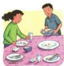
1. clear the table