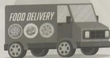
B: Food delivery