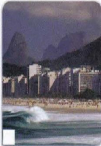
Rio de Janeiro