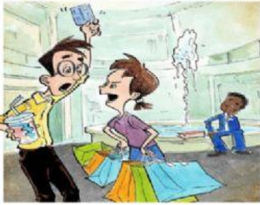
Sound 4: bought, fought