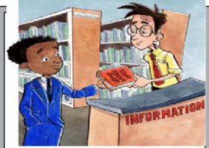
Sound 6: through