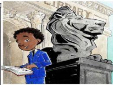
Sound 5: enough, tough