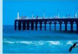
Cerro Azul Beach