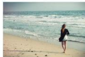
Walk on the beach