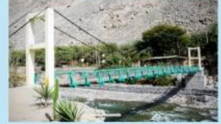
The Suspension Bridge