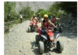
Ride a quad bike