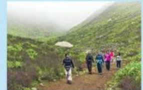
The hills (of Asia)