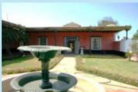
Montalban Plantation house