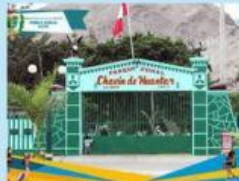
Chavin de Huantar Zone park