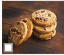
chocolate chip cookies