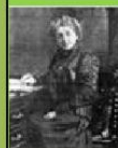
Josephine Cochrane 1839-1914 Place: Ohio, USA Profession: Inventor Invention: the dishwasher

She was an _____. She _____ the dishwasher.