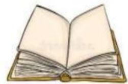
eraser / book