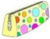
pencil case / pencil