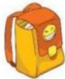
book / bag