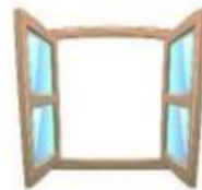
window / door