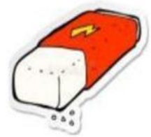
bag / eraser