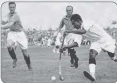
Dhyani Chand of India playing against France in the 1936 Olympic Final

In a game of hockey, there are usually two 35-minute halves with a 5-minute interval in between. At the start of each half, as well as after each goal is scored, the game is started with other in the centre of the field. To passback, two opposing team members face each times, and then try to gain control of the ball and hit it to a teammate.