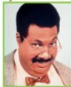
The Nutty Professor

9 Look at the photos. Write questions about the people.