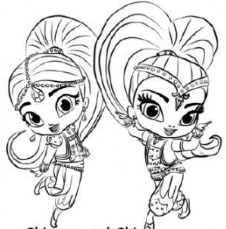
Shimmer and Shine

6. She is small. She's got short brown hair and big brown eyes. Her head is big but her body is small. She's wearing orange T-shirt and pink shorts. Her name is _____.