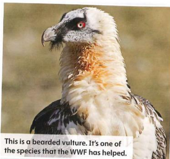
This is a bearded vulture. It's one of the species that the WWF has helped.