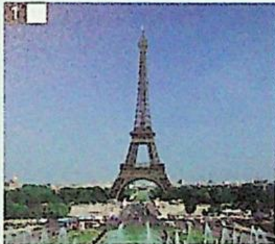
The Eiffel Tower