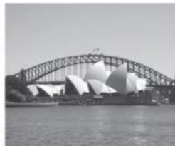
2 Sydney, _____