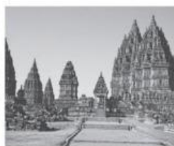
8 Java, _____