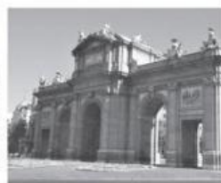
9 Madrid, _____