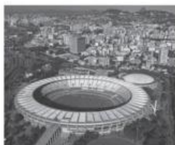
4 Rio de Janeiro, _____