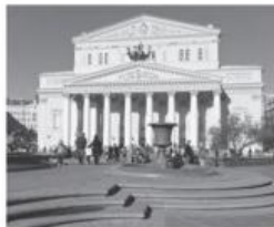
1 Moscow, Russia

3 Label the photos with the names of the countries.