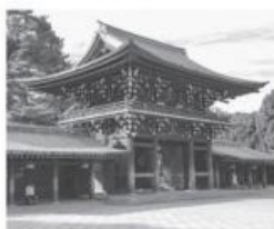
7 Tokyo, _____