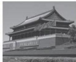
3 Beijing, _____