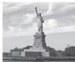
6 New York, _____