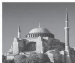
5 Istanbul, _____