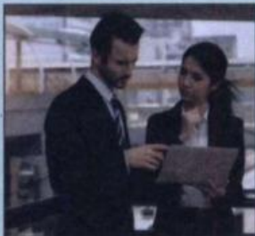
a businessman/ businesswoman