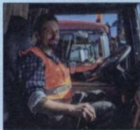
a lorry driver (ALSO a train/bus/taxi driver)