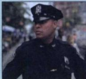
a police officer/ policeman/policewoman