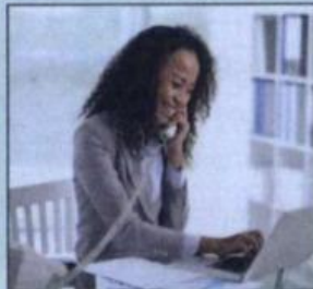
a secretary in a company