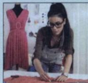
a fashion designer