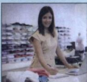
a shop assistant/ sales assistant