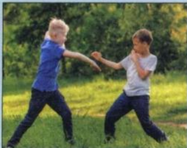
The boys were fighting . The boys were having a fight .