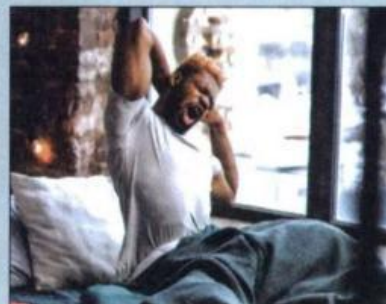
I slept well. I had a good sleep .