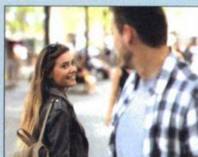
She smiled at me. She gave me a smile .