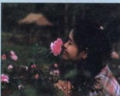
Does it smell nice? Does it have a nice smell ?