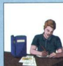
do your homework