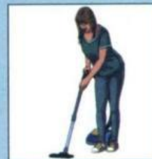
do the housework