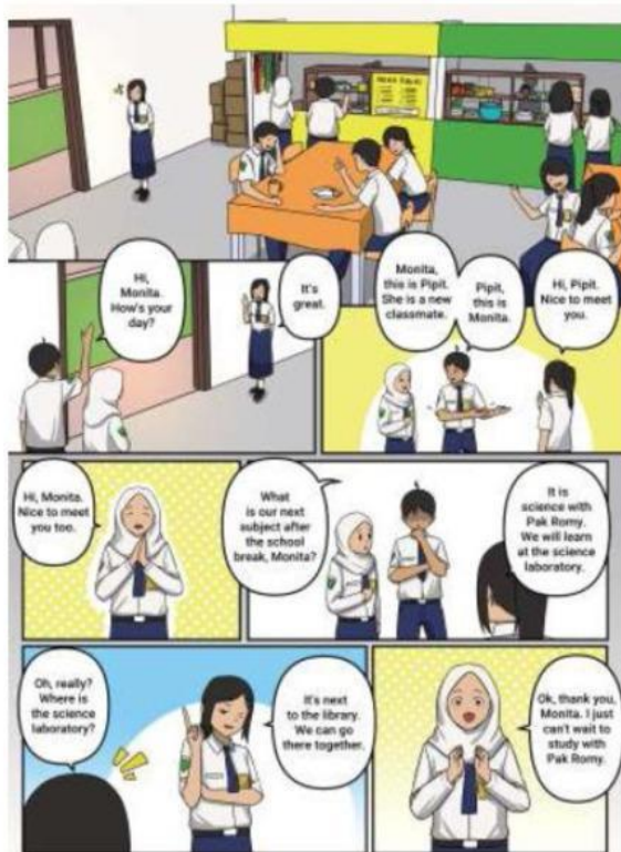
Comic strip 5.1 At the canteen

19. Read the dialogue and choose the True or False statement based on the dialogue.