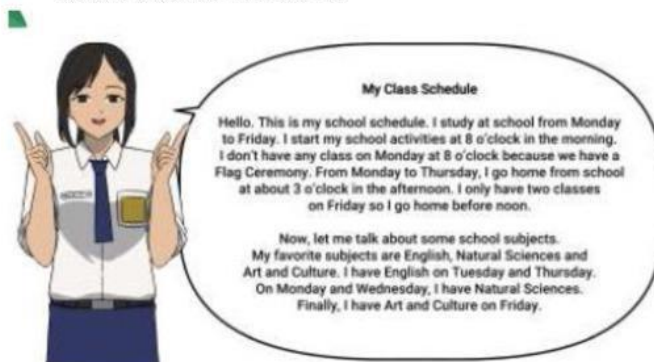
Text 4.1 Monita describing her class schedule.

4. What time does she usually go home from school?