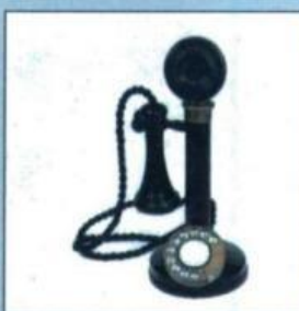
phone (ALSO telephone)