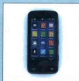
phone / mobile (phone)

A fan is an unusual shape and is used to make you cooler. It's made of wood and material or paper. There are also electric fans .