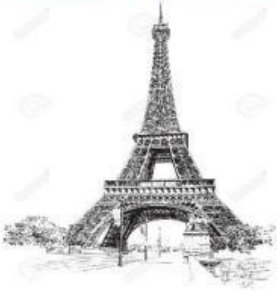
1. T _ _ _