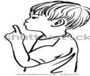
6. Q _ _ t