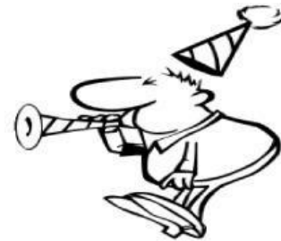
9. N _ _ _ _