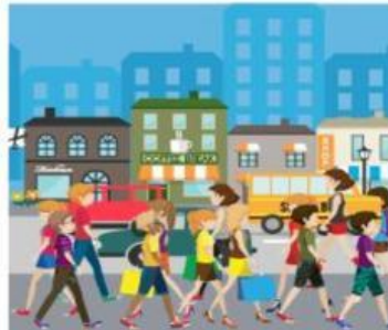
5. C _ _ w _ _