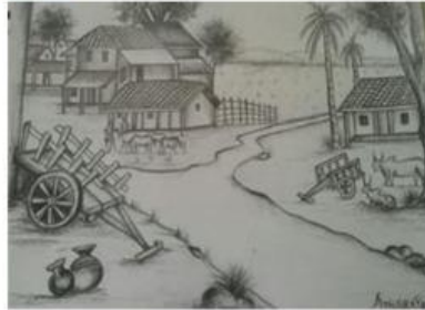
2. V _ _ l _ _