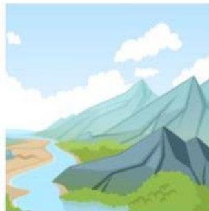
8. M _ _ n _ _ n