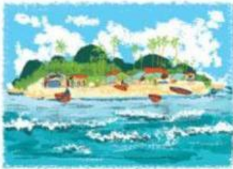
4. I _ _ N _