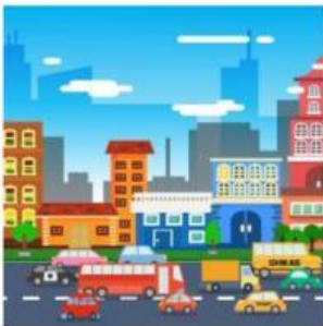
7. C _ _ _