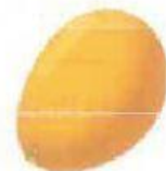
bladder and water balloon

12) The large intestine measures about _____ meters long.