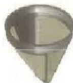
kidney and coffee filter