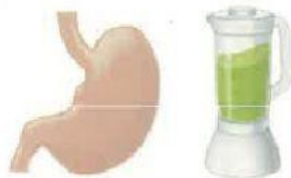
stomach and blender

11) Explain how each of the items shown below are alike 1.5 point each