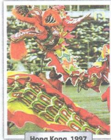
Hong Kong, 1997