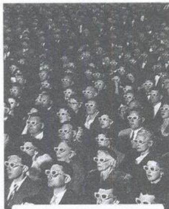
3D movie from the 1950s