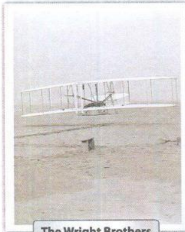
The Wright Brothers

B PAIR WORK Ask your partner these questions. Put a check (✓) if your partner gives the correct answer. (The correct answers are in bold .) Then compare quizzes. Who has the most correct answers?