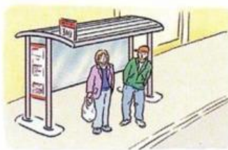
a bus stop