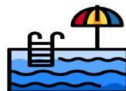
D. a pool