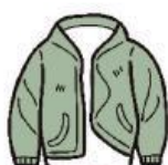
E. a jacket