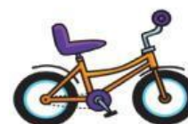
H. a bike