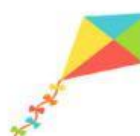
C. a kite