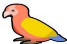
A. a parrot

Part 1: Look and read. Choose the correct words and write letter A to H on the lines. There is one example. (5 points)