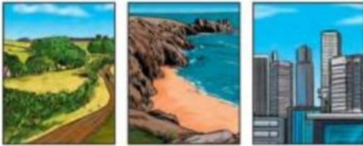
A B C

1 Where will the man and woman go for the weekend?