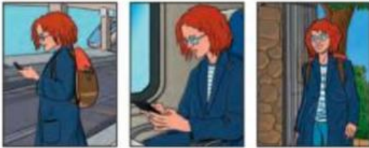
A B C