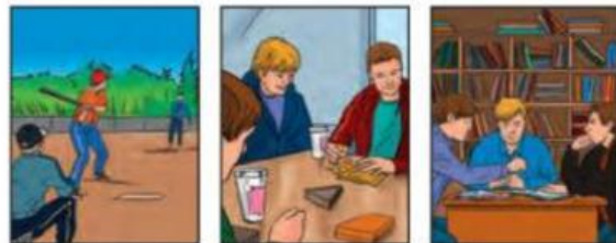
A B C

6 What will the family do this afternoon?