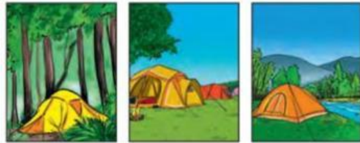
A B C

3 Where did the family spend the first night of their holiday?