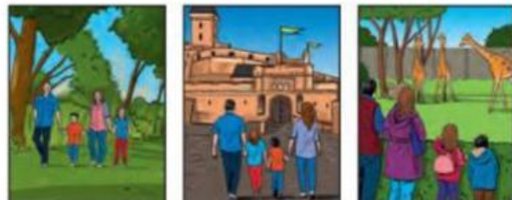
A B C

6 What will the family do this afternoon?