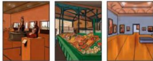
A B C

7 Where will the coach pick up the visitors?