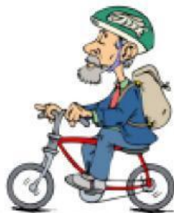
ride a bicycle