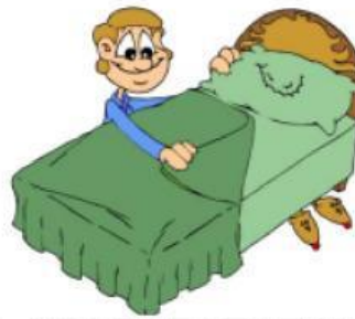
go to bed