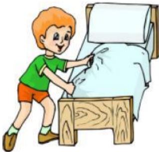
make the bed