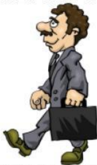
go to work