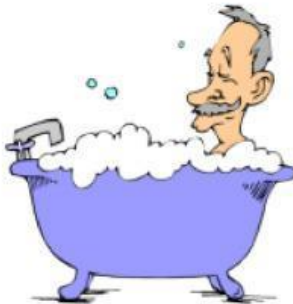
have a bath