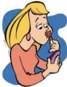
put on makeup