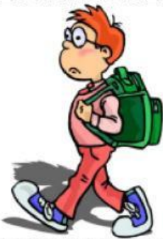
go to school