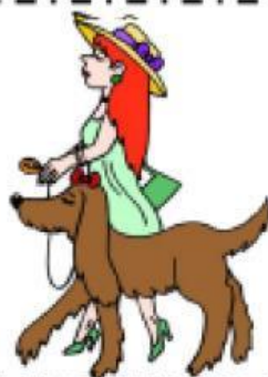
walk the dog