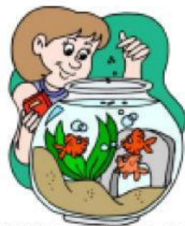
feed the fish