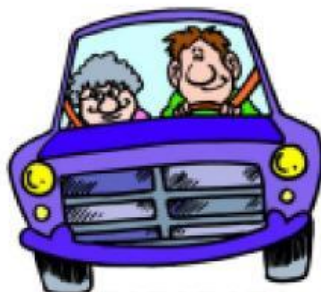
drive a car