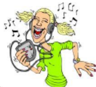
listen to music