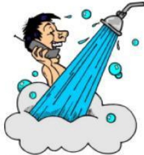
take a shower