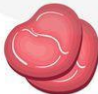
A kilo of meat