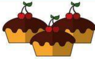
A batch of cakes