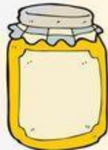
A jar of honey