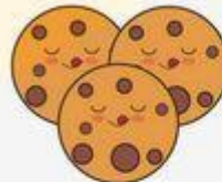
A pile of cookies