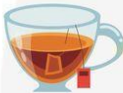
A cup of tea