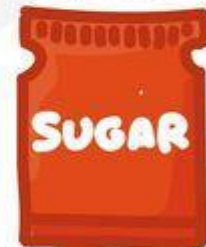
A kilo of sugar