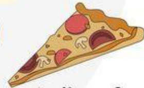
A slice of pizza