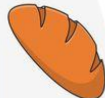
A loaf of bread