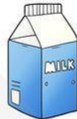
A carton of milk