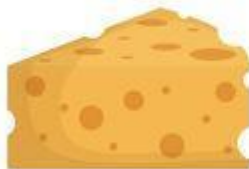
A piece of cheese