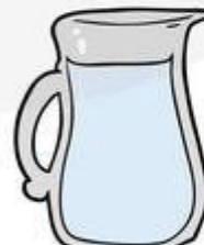
A jug of water