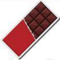
A bar of chocolate