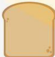
A slice of bread