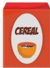
A box of cereal