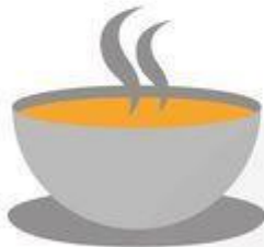
A bowl of soup