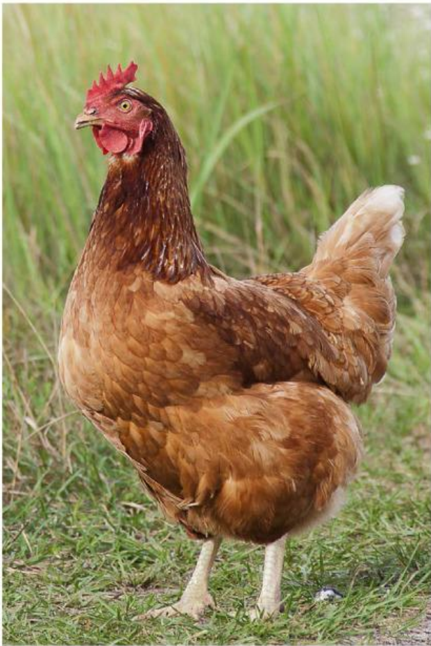
The Chicken • Level aa