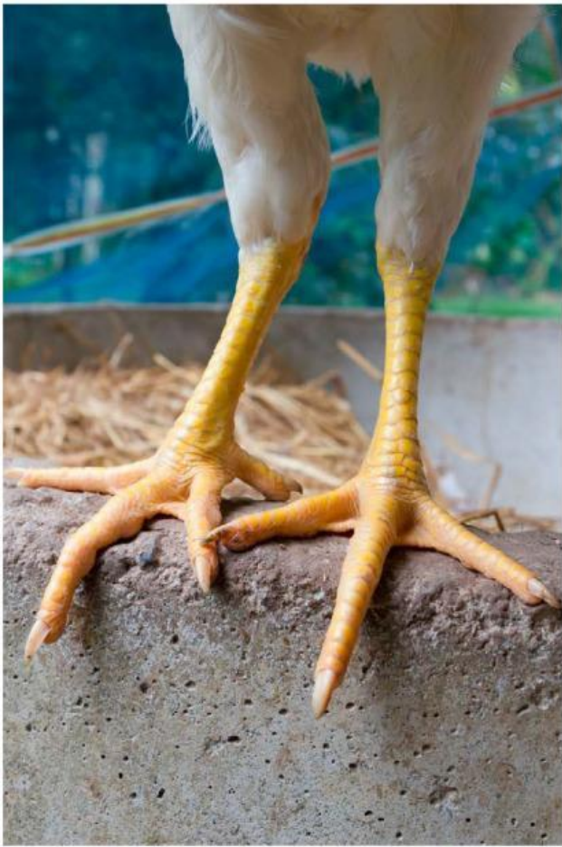
The Chicken • Level aa