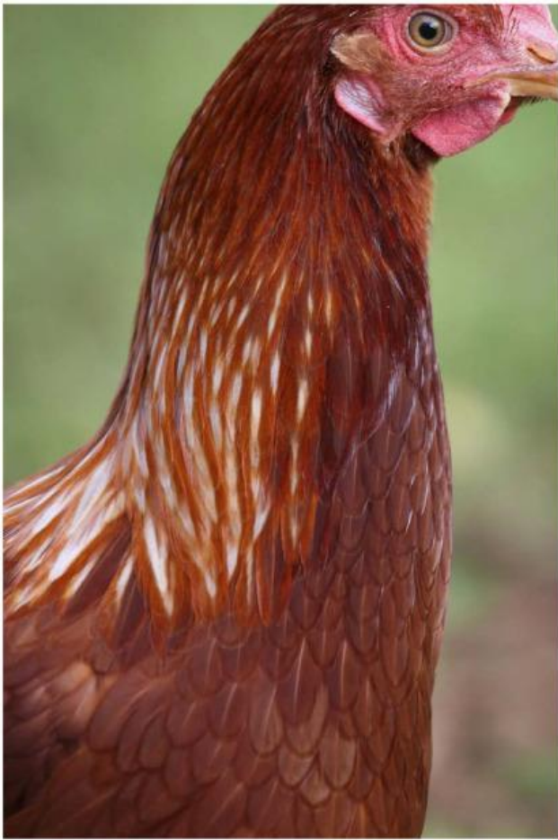
The Chicken • Level aa