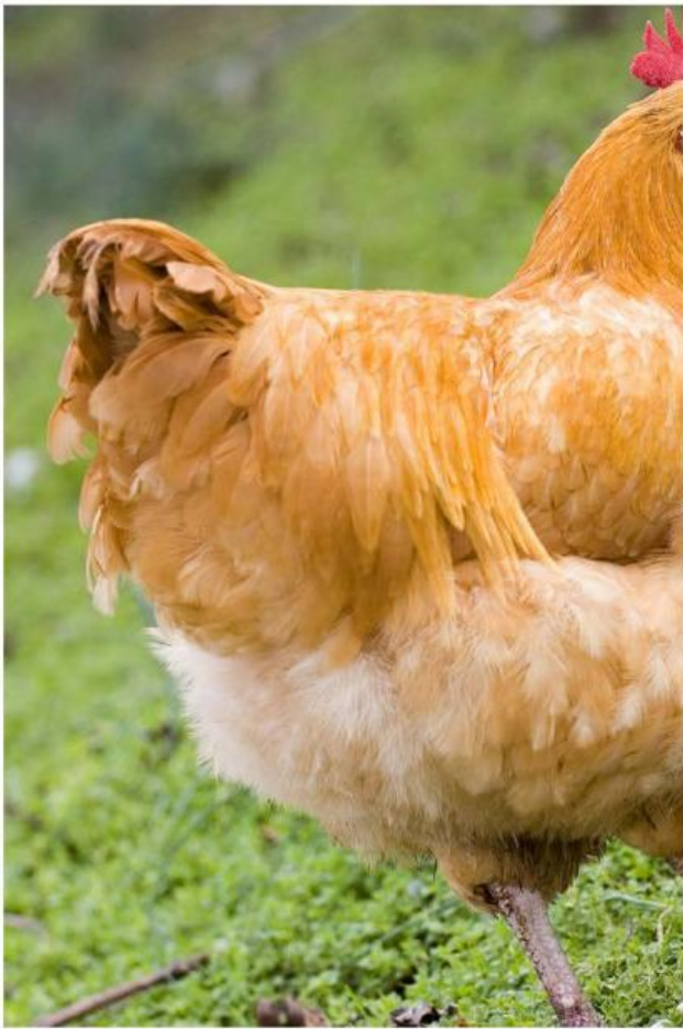
The Chicken • Level aa