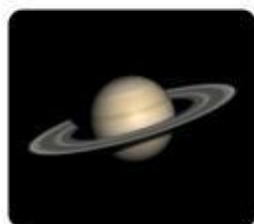
5 p _____