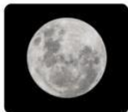
8 m _____