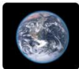
6 E _____