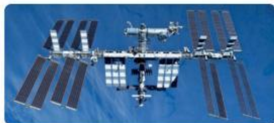
3 the International S _____ S _____