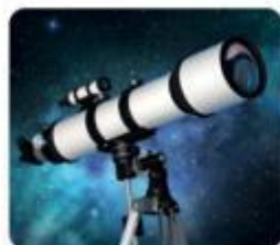
9 t _____

2 ●● Write the correct word for each definition.