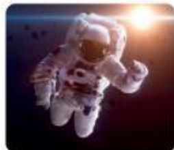
2 a _____