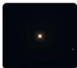
4 s _____