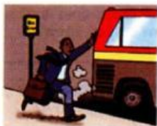
I missed the bus.