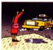
I couldn't get a taxi.