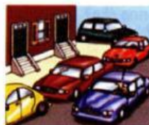
I couldn't find a parking space.