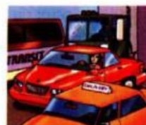
I got stuck in traffic.