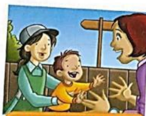
help a lost child ✓