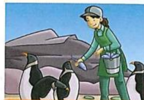
feed the penguins ✓