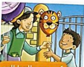
sell balloons ✓