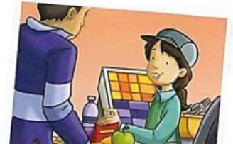
work in the cafeteria ✗