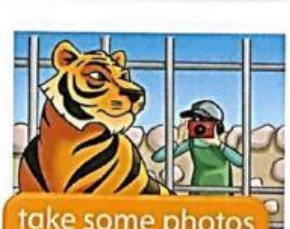
take some photos for the website ✓

0. The weather was ( too ) / quite / fully / almost) cold for the children to go out. They may be sick easily.