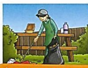
clean the picnic area ✗