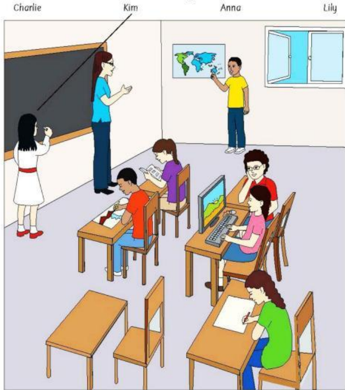
Peter Mary Jim

Listen and draw lines. There is one example.