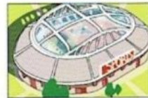
the sports centre