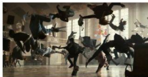
This video clip

During the presentation of a new smart watch, Apple showed a short commercial. The video advertises a combination of the new Apple Watch Series 3 gadget with the Apple Music service. The commercial was shot in Kyiv Central Railway Station, as well as Zoloti Vorota metro station.