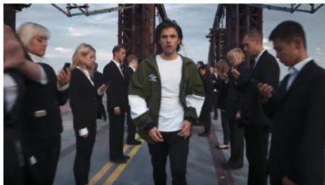
This video clip

The music video for the French track Basique, shot for rapper Orel San, is set on the unfinished Podilsko-Voskresenskyi Bridge. The rapper walks between two long lines of people dressed in black and white clothes. They are all wearing jockey hats and hoods and holding money, briefcases and weird items, while walking, marching and dancing.