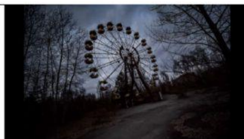
This video clip

In 2014, British legends Pink Floyd arrived in Prypiat to film a music video. The second part of the clip shows the empty Ukrainian city, where the terrible accident happened at the Chornobyl nuclear power plant in 1986. The video also contains clips from the International Space Station.