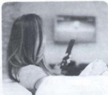
1 h a v e the T V o n

a Complete the verbs and verb phrases with the missing letters.