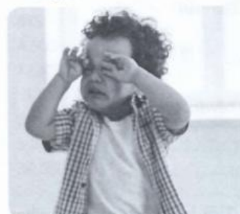
7 c y