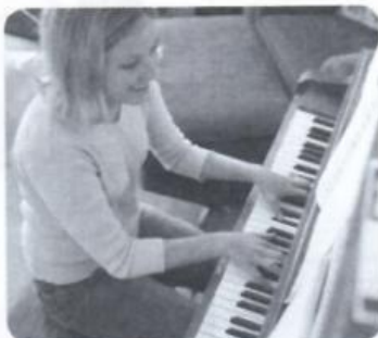
2 p a t s the p a o