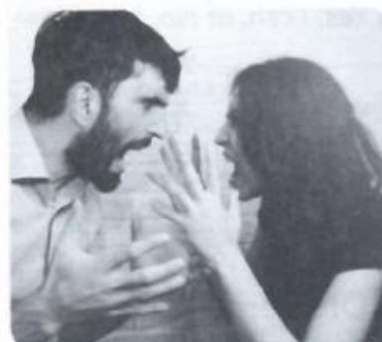
5 a g e