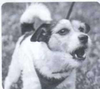
3 b r