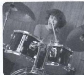
8 m k a lot of n i e

b Complete the conversations with verbs from the list.