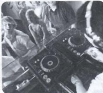
4 h v a noisy p r y