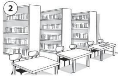
l _ br _ ry