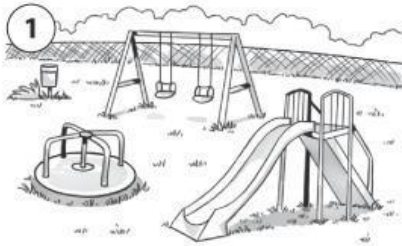
pla y ground