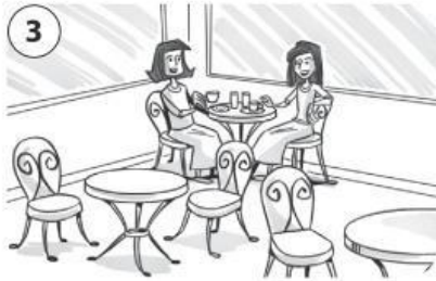
c _ _ é