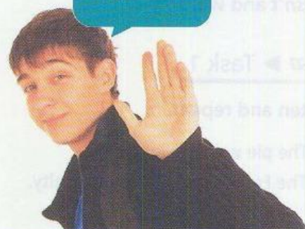
End a conversation

Do people use these expressions to greet someone or to end a conversation? Check (✓) the correct answer.