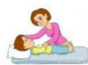
Are you OK?