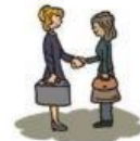
Nice to meet you!