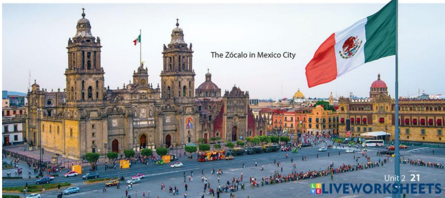
The Zócalo in Mexico City

The city is beautiful, the streets are clean, and the houses are small.