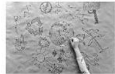
making a poster

Today is a special day at school. We're all doing different things. Sara and Dan are 1 _____ for the school garden. Sara is giving it some water. Maria and Paulo are 2 _____. It's a great game! Lucy is 3 _____. She can use big numbers. Tina and Ed are 4 _____. Ed is painting its head. Zoe is 5 _____. What's in the hat? Lucas is 6 _____ with pictures on it for the classroom. Ben is 7 _____. He can write big words. Emma is 8 _____. They're pictures for a story. We're having fun!