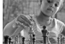
learning to play chess