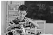
making a robot