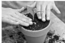
growing a plant