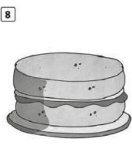
an _____ cake