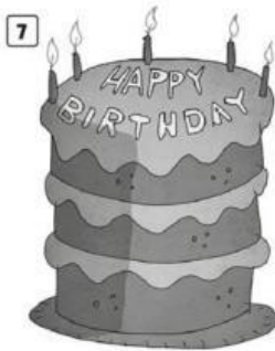
a _____ cake