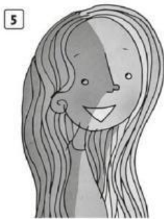
_____ hair colour