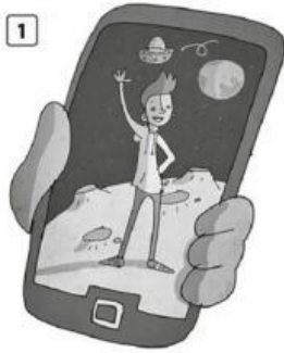
a fake photo

artificial fake female male natural ordinary real special