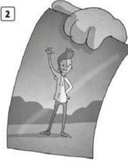
a _____ photo