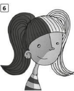
_____ hair colour