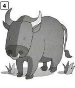
a _____ animal