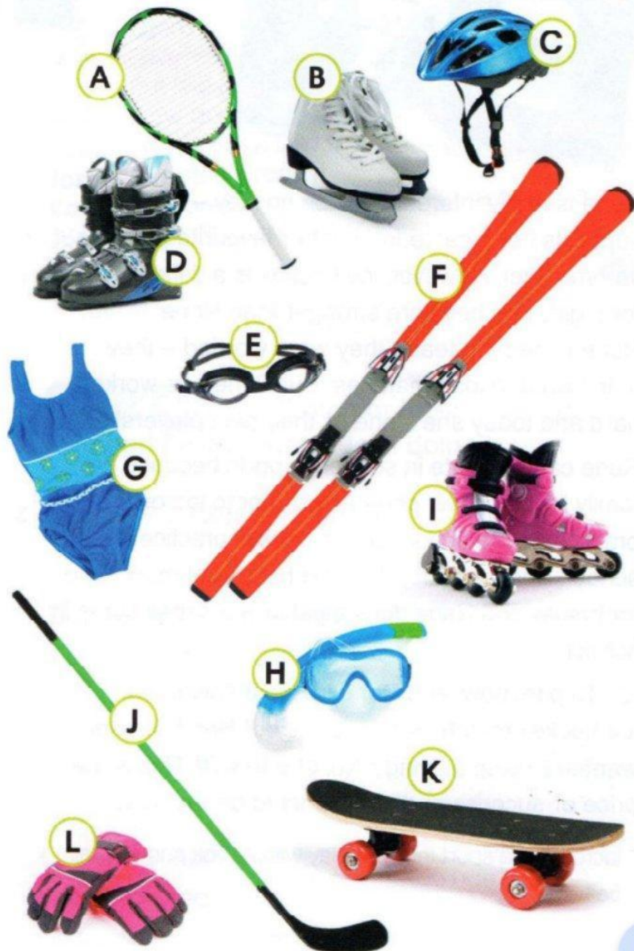
A tennis racket

boots gloves goggles helmet hockey stick ice skates rollerblades skateboard skis snorkel mask swimsuit tennis racket