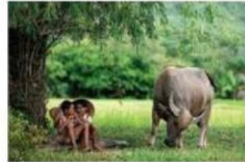
2 h _____ buffalos