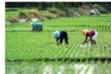
6 p _____ dy f _____ d

2 Complete the sentences with the words below.