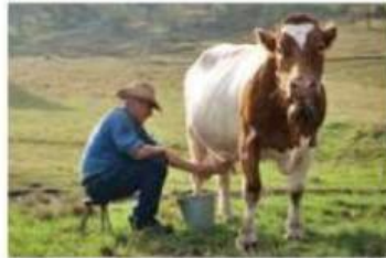
3 mi _____ the c _____