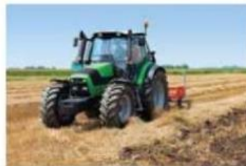
5 t _____