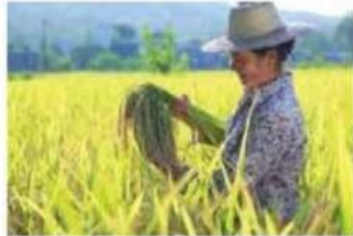
1 h _____

Prepositions of time and place | Comparative adverbs