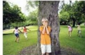
4 play h _____ and s _____