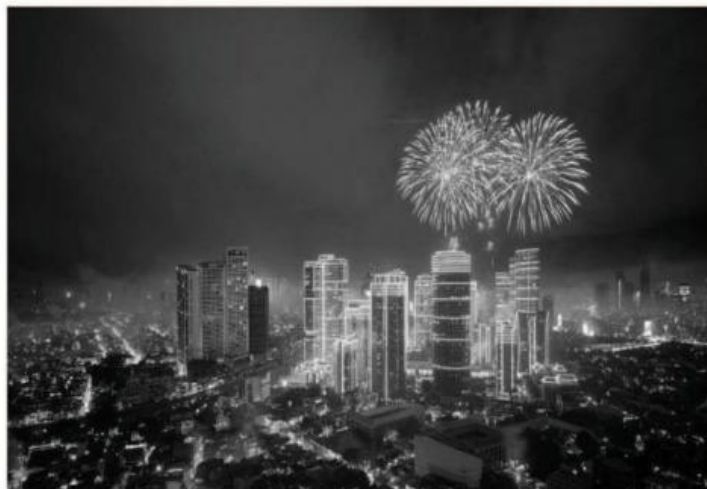
▲ Fireworks in Manila, Philippines, on New Year's Eve