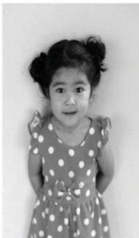
▲ A young girl wears a polka dot dress.

Dutch from the Netherlands round circle shaped