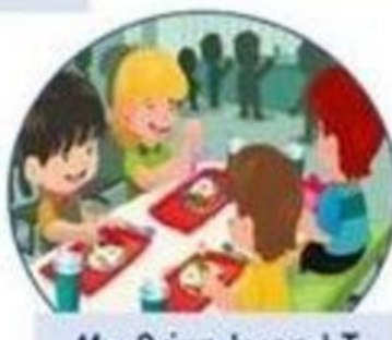
My friends and I