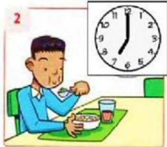
He _____ _____ at seven o'clock.