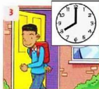
He _____ _____ at eight o'clock.