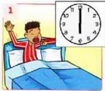
He gets up at six o'clock.

has breakfast gets up goes to bed goes to school