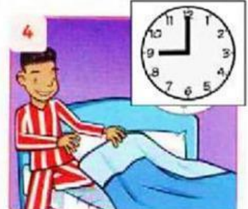
He _____ _____ at nine o'clock.