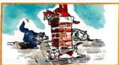
6 Suzie and Cosmo / stay at home ✗