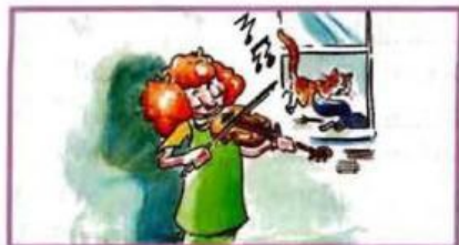
1 Kikki / play the violin ✓ Kikki played the violin