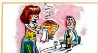
4 Leslie / cook spaghetti ✓