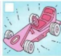
A new pink go-kart.