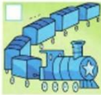
A long blue train.