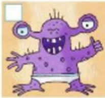
An ugly purple monster.