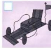
An old black go-kart.