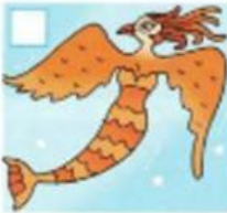
A beautiful orange monster.