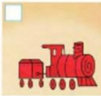
A short red train.